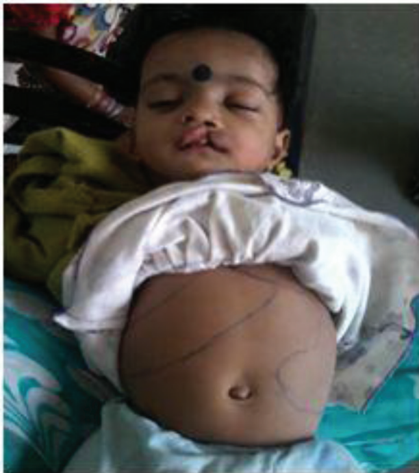
Figure 1: Clinical photograph.

Workup for osteopetrosis was done by taking X-rays. The anteroposterior [Figure 2] and lateral skull radiographs [Figure 3] showed marked sclerosis with thickening of the orbital rims, skull base, and calvarium with a loss of distinction between the cortex and medulla. A lateral radiograph of the spine [Figure 4] showed diffusely increased bone density