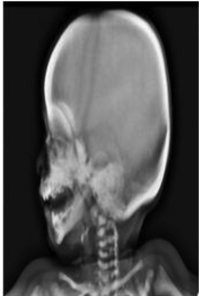
Figure 3: Lateral view of skull.