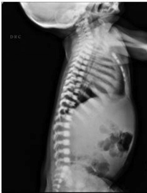
Figure 4: Lateral view of spine.